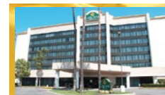
La Quinta Inn & Suite La Palma